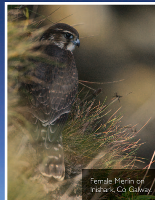
Female Merlin on Inishark, Co. Galway.