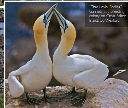
"That Lovin' Feeling" — Gannets at a breeding colony on Great Saltee Island, Co. Wexford.