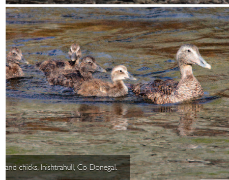
and chicks, Inishtrahull, Co. Donegal.