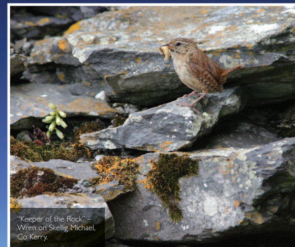
"Keeper of the Rock" — Wren on Skellig Michael, Co. Kerry.